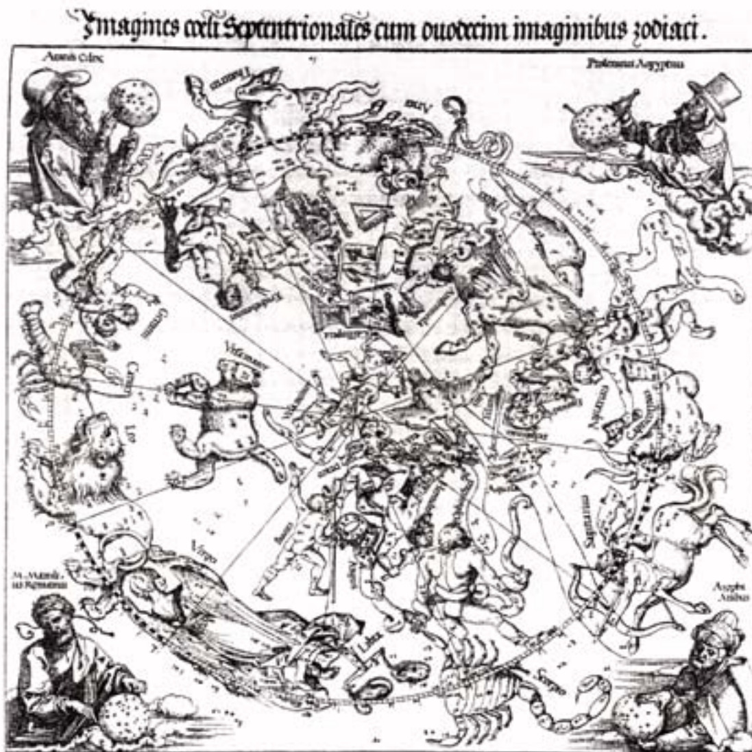
The Northern hemisphere of the heavens as drawn in 1515 by Albrecht Dürer. Zodiac in the outer circle and Milky Way in vertical diagonal

mission. Pleroma are actually very active in the spiritual world, and occultism indicates such collaborations by giving them a feminine name (Diana, Mary, Hecate, Anthroposophia, etc). For example, the Archangel Michael is a spiritual entity with a specific mission to help humanity, but he also collaborates with other entities in a pleroma that supports evolution, the pleroma from which all other pleroma originate, the pleroma generated by the cosmos, the pleroma known as Mary. Therefore, the presence of a pleroma in the Milky Way shows us that it is characterized by a Marian aspect or is a manifestation of Mary. Here we are faced, therefore, with the cosmic body of the Most Holy Mary, an entity that we have already described under the name of Divine Providence. Mary is also deeply tied to the sphere of the Holy Spirit 6 , and so it is no surprise that we find her associated with the Holy Spirit aspect of the Most Holy Trinity.