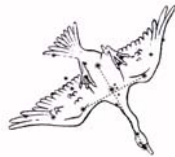
The Stars of Cygnus

Cygnus is, in short, the door for the Christic forces to enter the human evolutionary system. It is the seat through which the Christ - the Son of the Most Holy Trinity which is found beyond the Milky Way in the macrocosm - becomes manifest in the Holy Spirit (of the Most Holy Trinity), and from there into the Holy Trinity (accessed through the constellation of Aries, the Lamb) and then to Earth, where he completed the act of love known as the Mystery of Golgotha. This perspective on the Swan allows us to grasp the extent of the sacrifice of Christ, the immense spiritual sacrifice that this very high entity - who belongs to the Most Holy Trinity and whose home lies beyond our own galaxy - has made for the sake of mankind by binding himself freely to his creatures for the evolution of man.