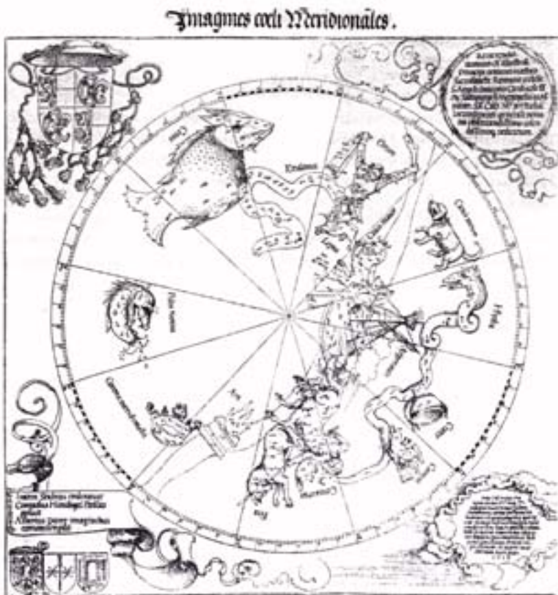
The meridional hemisphere by Dürer with the lower Milky way

Now that we have characterized some spiritual aspects of the Milky Way, it would be useful to understand who this galaxy of ours is, not just what it is. We can turn to a more descriptive approach. First we will focus our attention on the points where the Milky Way, in its wide embrace of the solar system, crosses the Zodiac: these crossing points are located between Taurus and Gemini - the region that corresponds in humans (as we shall see) to the neck and shoulders - and between Scorpio and Sagittarius, which is in the area of the pelvis. This allows us to see that the Milky Way analogue within us, "rises" at the shoulders to "set" in the pelvis, and thus corresponds to our arms. The arms - our most active doing bodily member, our will, the primary tools of our actions in the world - are the parts of our body through which we can be the conscious vehicle of our highest spiritual forces, those of Divine Providence, the Most Holy Trinity, that is the active Entity who promotes the transformation and evolution of humanity.