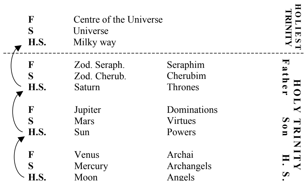
Example of resonance of the Holy Spirit sphere.

At the same time this threefold pleroma of Sophia also corresponds to the aspects of Father, Son and Holy Spirit, the Holy Trinity, and each of these is, in turn, divided into a Father, Son and Holy Spirit aspect. We do not normally have the strength to communicate directly with these higher spheres, but we still have the possibility, through a logic of "resonance". These sub-articulations resonate with each other: the Holy Spirit aspect of the Holy Spirit of the Holy Trinity (sphere of the Moon) resonates with the Holy Spirit appearance of the Son, (sphere of the Sun) and of the Father (sphere of Saturn). At the same time there is a resonance of the lunar sphere