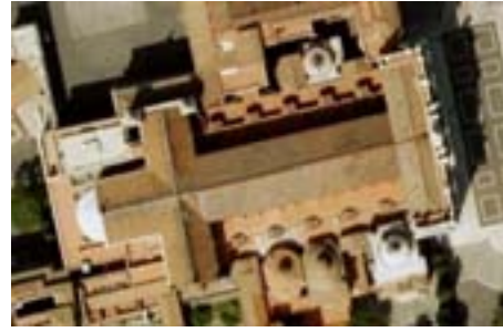
The Basilica of St. Peter and the Basilica of San Giovanni in Laterano

Perhaps we can understand why John, in his Gospel, makes no mention of the institution of the Eucharist. We may also understand why, in his Apocalypse, referring to that future Community based on love known as the heavenly Jerusalem, John says, " And I saw no temple therein: for the Lord God Almighty and the Lamb are the temple of it. " (Rev 21:22).