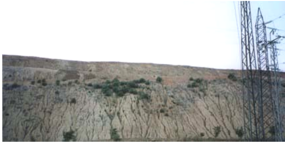
Example of how electromagnetic fields increase the process of erosion.

Obviously we can not respond here to all these questions, of which we have also already addressed in other contexts. However, we will try to respond to some of the more specific and more significant aspects.